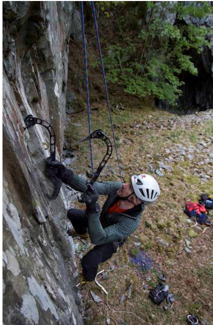
The upper part of 'Time and a Half'