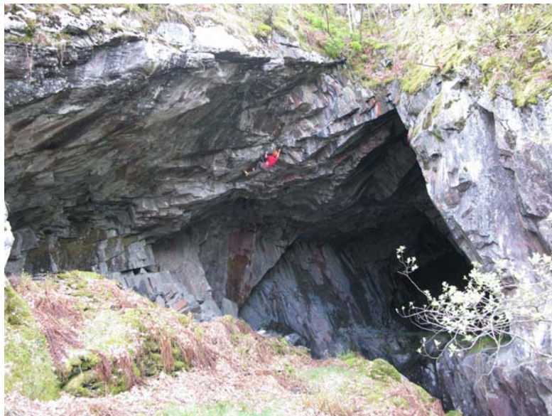
Climbing 'First Blood' M9+

This route links a series of roofs in a rightwards traverse to a lower-off on the lip out to the right.