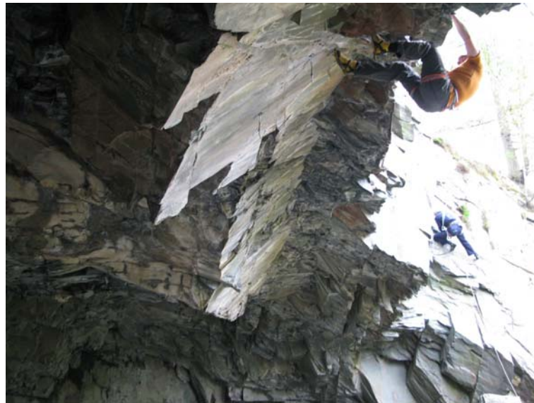
Working the 'Fang' M8

Climb the fang feature and the short roof to access the hanging groove. Step right and gain the upper groove, follow this to the top.