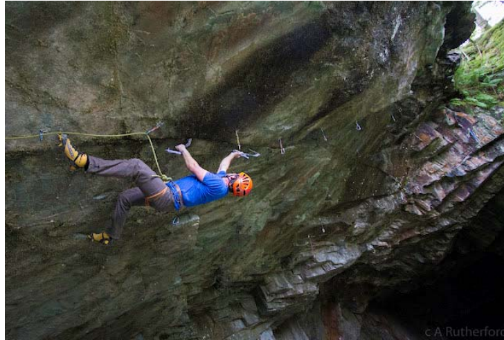
Working 'Bloodline' M10