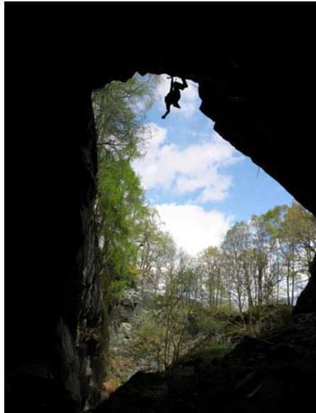
First Blood M9+

With a growing interest in Dry-tooling to train for winter climbing and as a sport in its own right great venues have been getting developed like White Goods in Wales and the original UK venue at Newtyle Quarry in Scotland. Following the 'Winter Ethics' debate there was a feeling amongst many that a Lakeland venue would be a good thing. This feeling may not be shared by all but hopefully having a dedicated venue confined to a couple of disused quarries with no existing rock climbs established will help to control dry-tooling and avoid people using crags with established rock routes to tool on. As well as controlling dry-tooling damage, the other aim was to offer a good quality venue with a good range of routes for climbers to train on for the winter and get a feeling for what dry-tooling is all about.