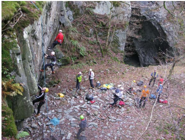
Lots of people enjoying the popular 'Industrial Sector' wall

The back of this quarry has 2 large caves, the right-hand cave has 8 routes, and this cave stays dry in the rain. The left-hand has 1 also.